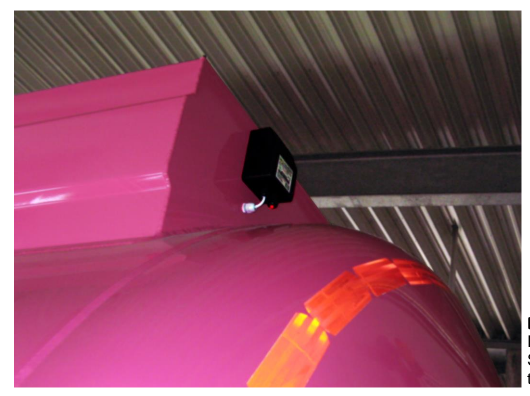
Practical example Installation of a SECU MultiGPS on a tank truck