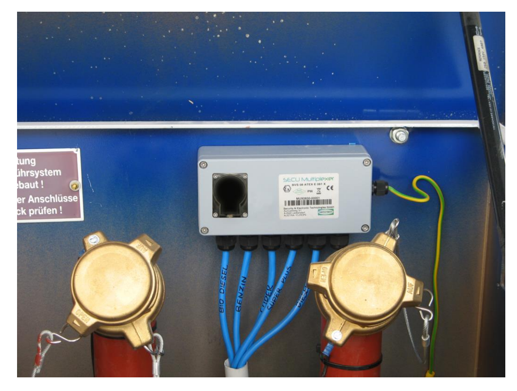
Practical example Installation of a SECU Multiplexer in the filling shaft