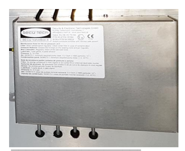
SECU ValveBox (closed)

The system is driving the solenoid valves and monitors back the signals of the pressure switches.