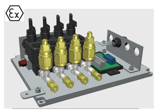
Open SECU ValveBox (without wiring)

SECU ValveBox, for tamper-proof controlling and monitoring of valves on tanker trucks (for example: bottom- and collector valves)